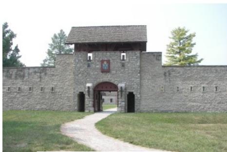
Fort du Chartres