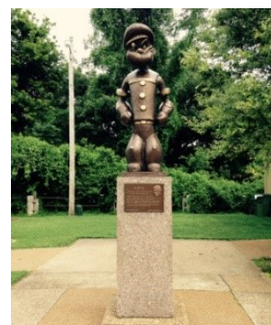
Popeye Chester, Illinois home of Elzie Segar, creator of Popeye