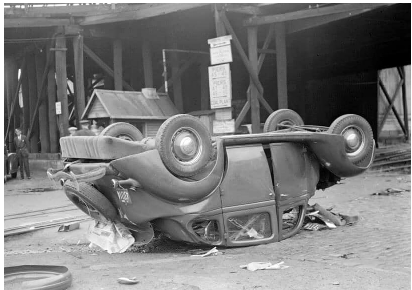
Original low mileage 36 Touring Sedan. Original paint, no bondo. Some alignment issues. Make offer.