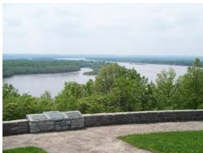
Remains of Fort Kaskaskia