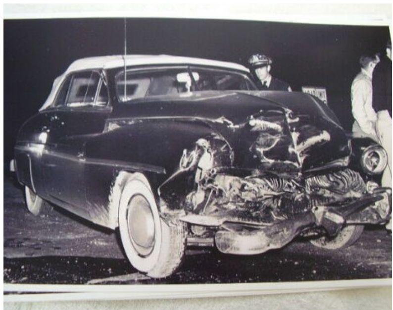
They Say Convertibles Hold Their Value Better Than Sedans!!