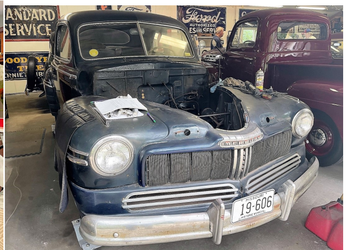
Bruce Has Finally Started On The 46 Restoration!!