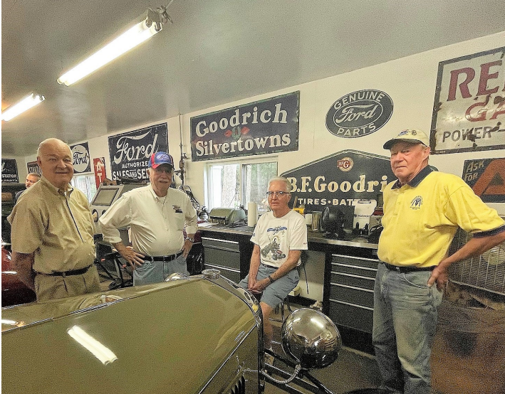
Guys In The Garage...Where Else Would They Be??