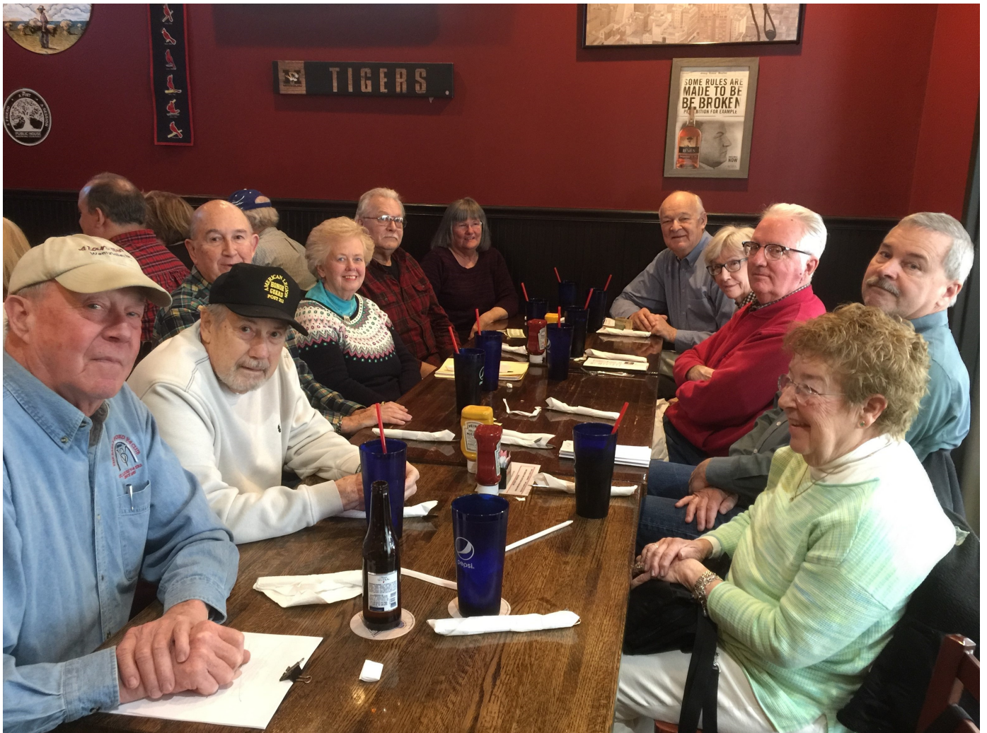
The Last Club Meeting At The Wildwood Pub February 2020

Remember when smoking was considered good for you???