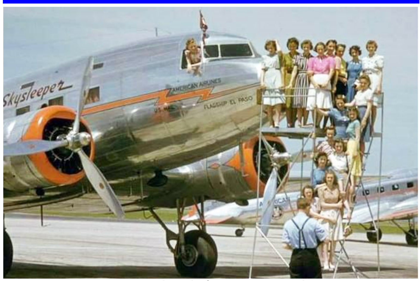
A Fresh Batch of Young American Airline Stewardesses Getting a Look at an American DC-3

Our Saturday Morning Breakfast will be stsrting up again on the First Saturday of the Month at 8:00 am at The Village Café. 314-578-3275