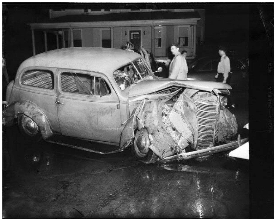
Thank Goodness It's Not a Ford!!!!