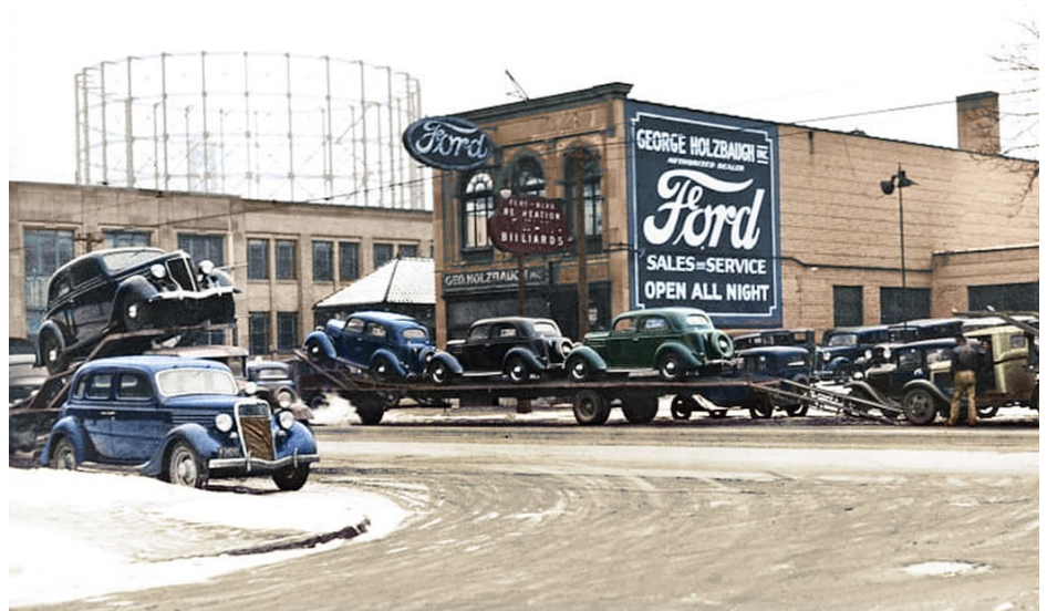
Another New Shipment of Ford Cars!!