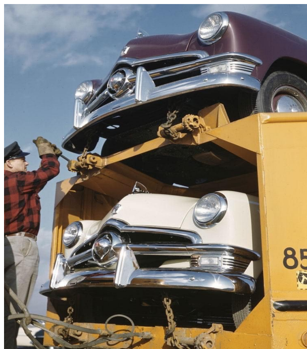
A Fresh Shipment Of 1950 Fords