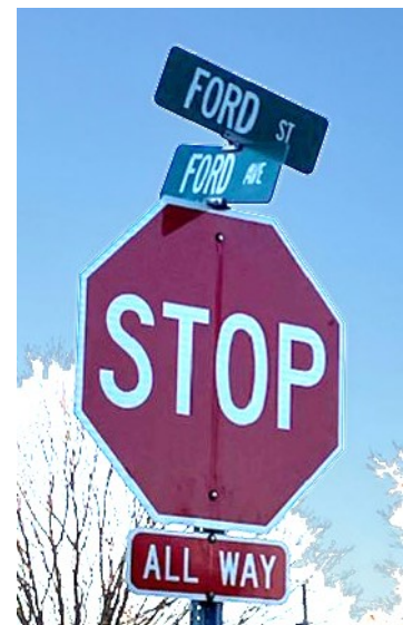
All Roads Lead to Ford