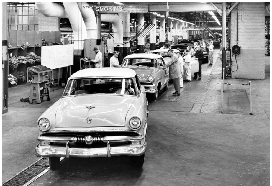
Your New Ford Is Ready