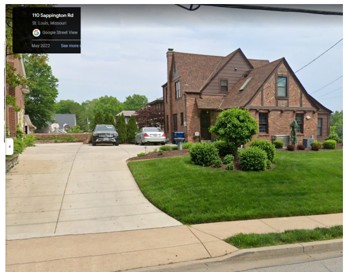
Driveway From Sappington