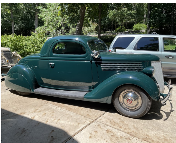
Dave Conrad's 36 3 Window Coupe