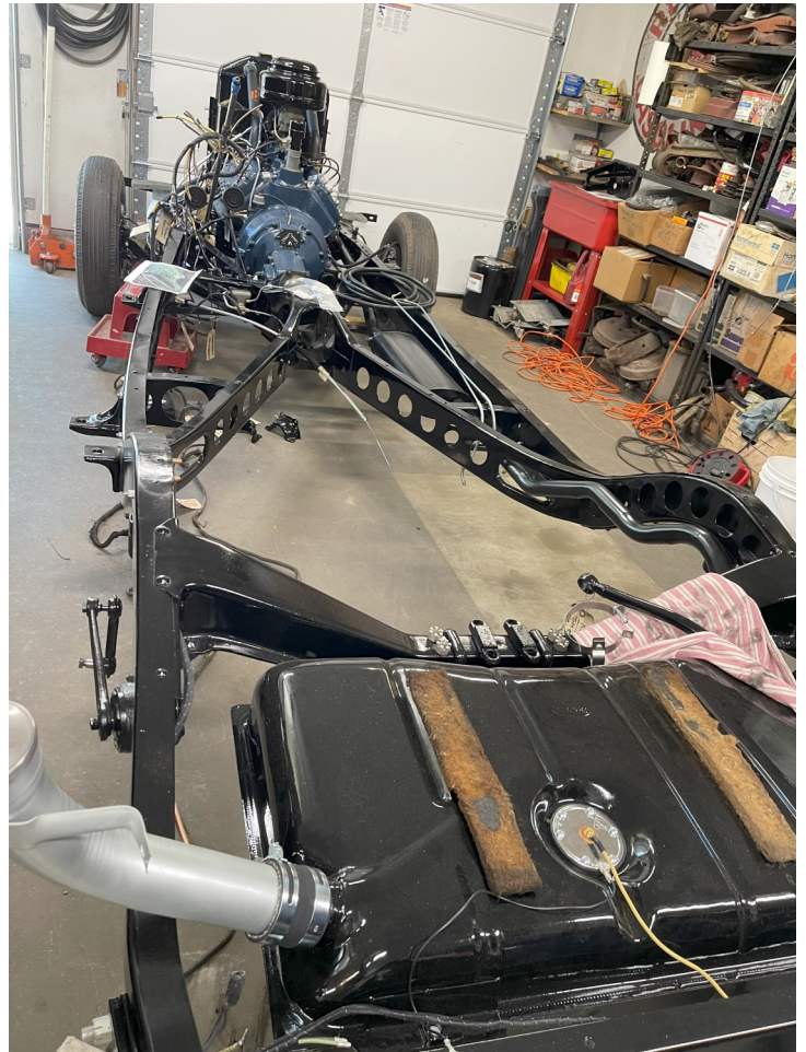
No Detail Spared In Bruce's Restoration