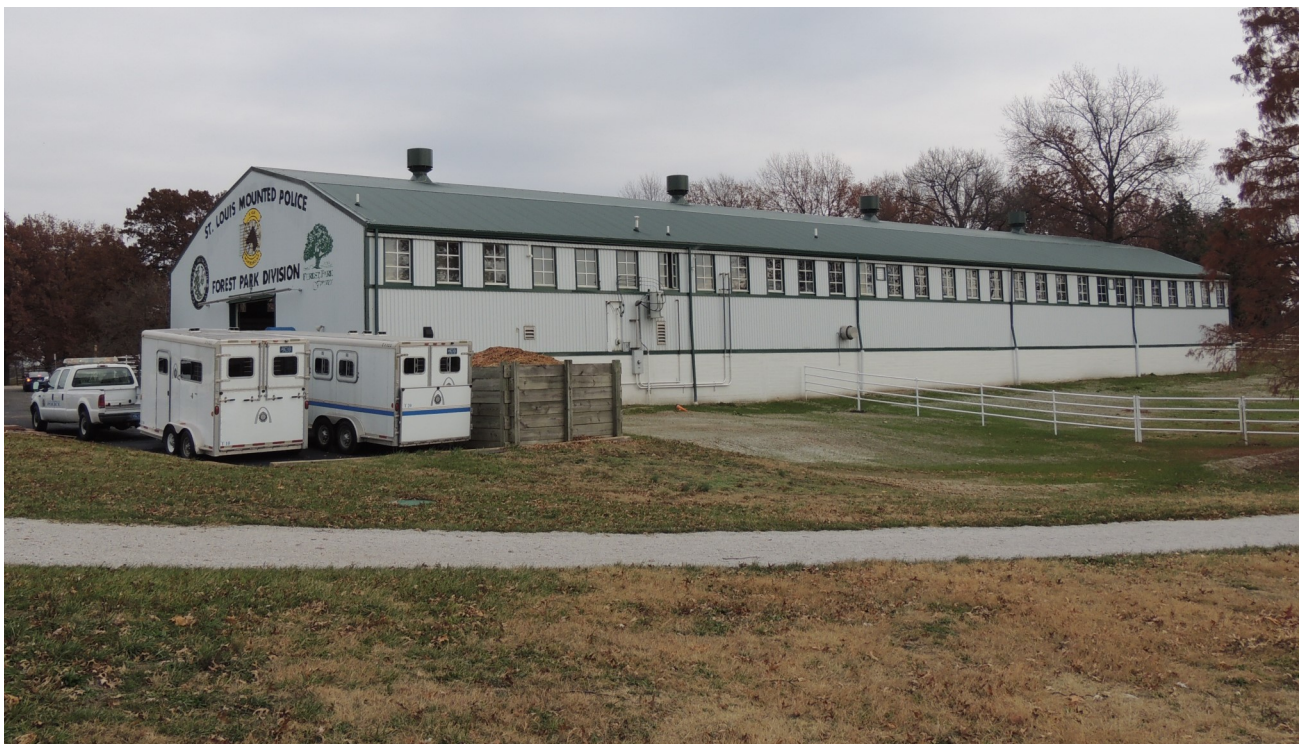
Old Airplane Hanger...Now Horse Stable

That section of Forest Park is now called the Boeing Aviation Fields; it boasts four baseball and four softball diamonds. So now, instead of air plane fly overs, there are now fly balls.