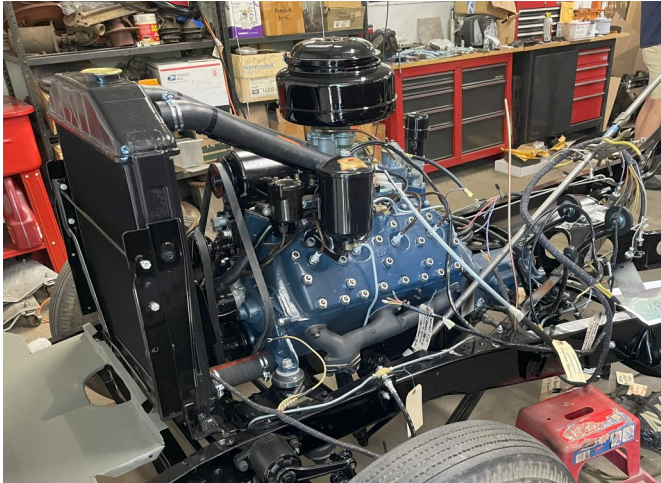
Beautifully Restored Engine and Chassis