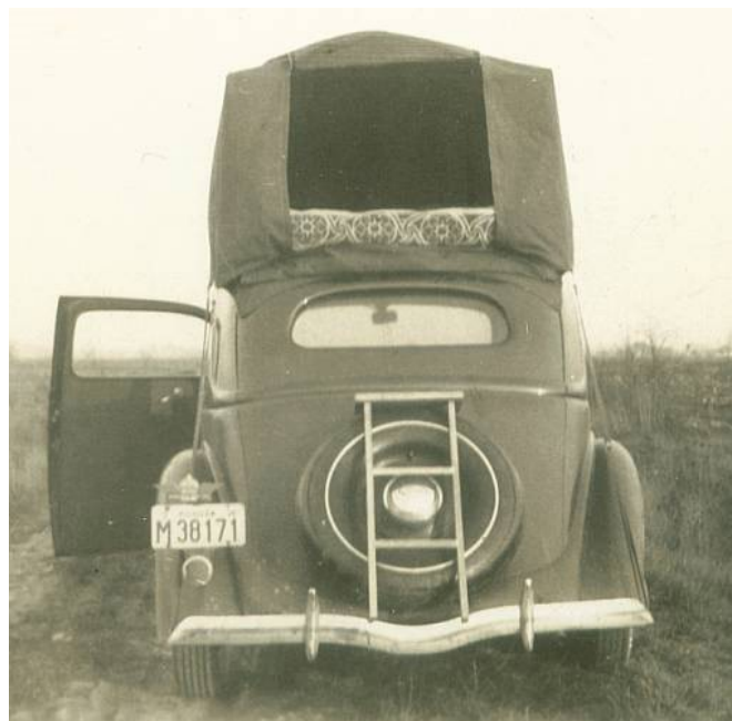
Uncle George's Camper