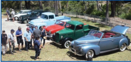
San Diego RG #19 on Drive your V-8 Day 2019

Did you take your V-8 out on "Drive Your V-8 Day" 2020?