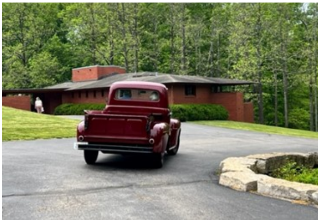
Driving by the Frank Lloyd Wright home