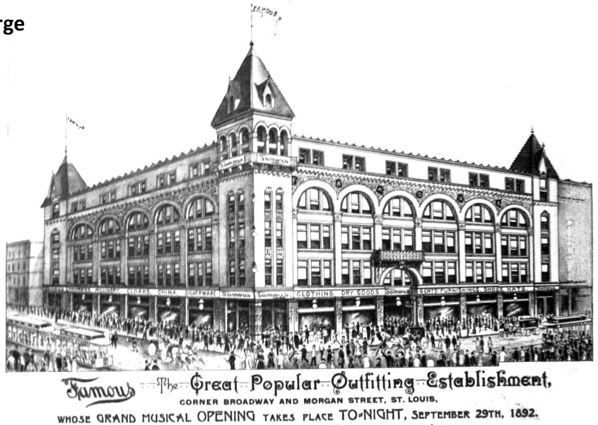
Famous Clothing Dry Goods Broadway & Morgan 1892

I did some research today, my passion with St Louis history, with a few pictures. Fell free to post whatever you need in the newsletter. If there is room for these pictures, I thought these were most interesting. (something for the ladies)