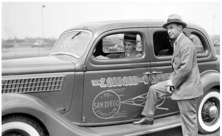
Excuse me Edsel Sir!!! Could you please take your foot off the running board.