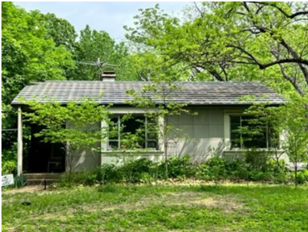
Lustron house in the neighborhood Bruce grew up in: