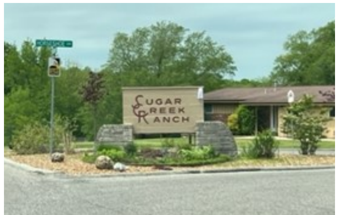
Sugar Creek Ranch sub-division