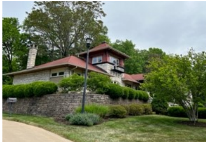
Train station at Meramec Highlands (now a home):