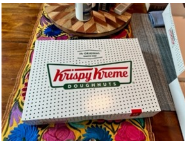
Fuel for the drive