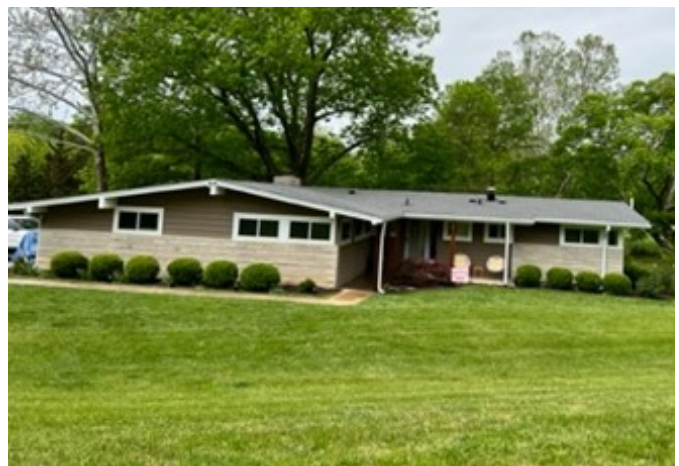
Mid-50's Style Ranch