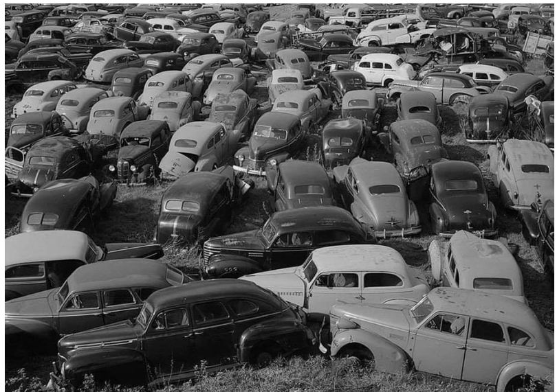
The First St. Louis Self Parking Lot