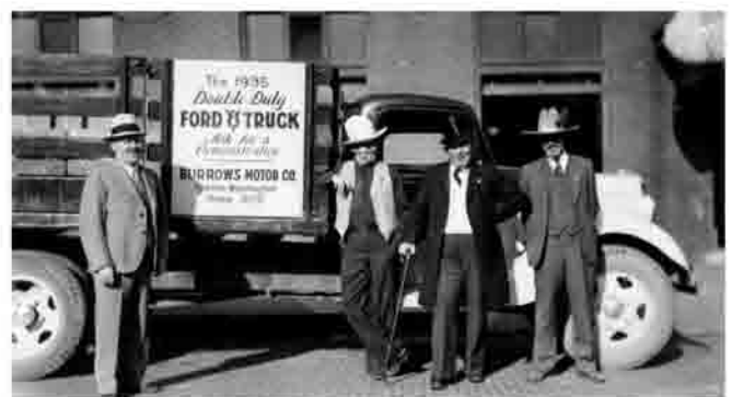
Cool dudes out west with the demonstrator