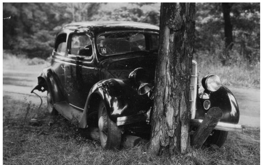
Now Where Did I Park My Car Last Night Hic...Hic