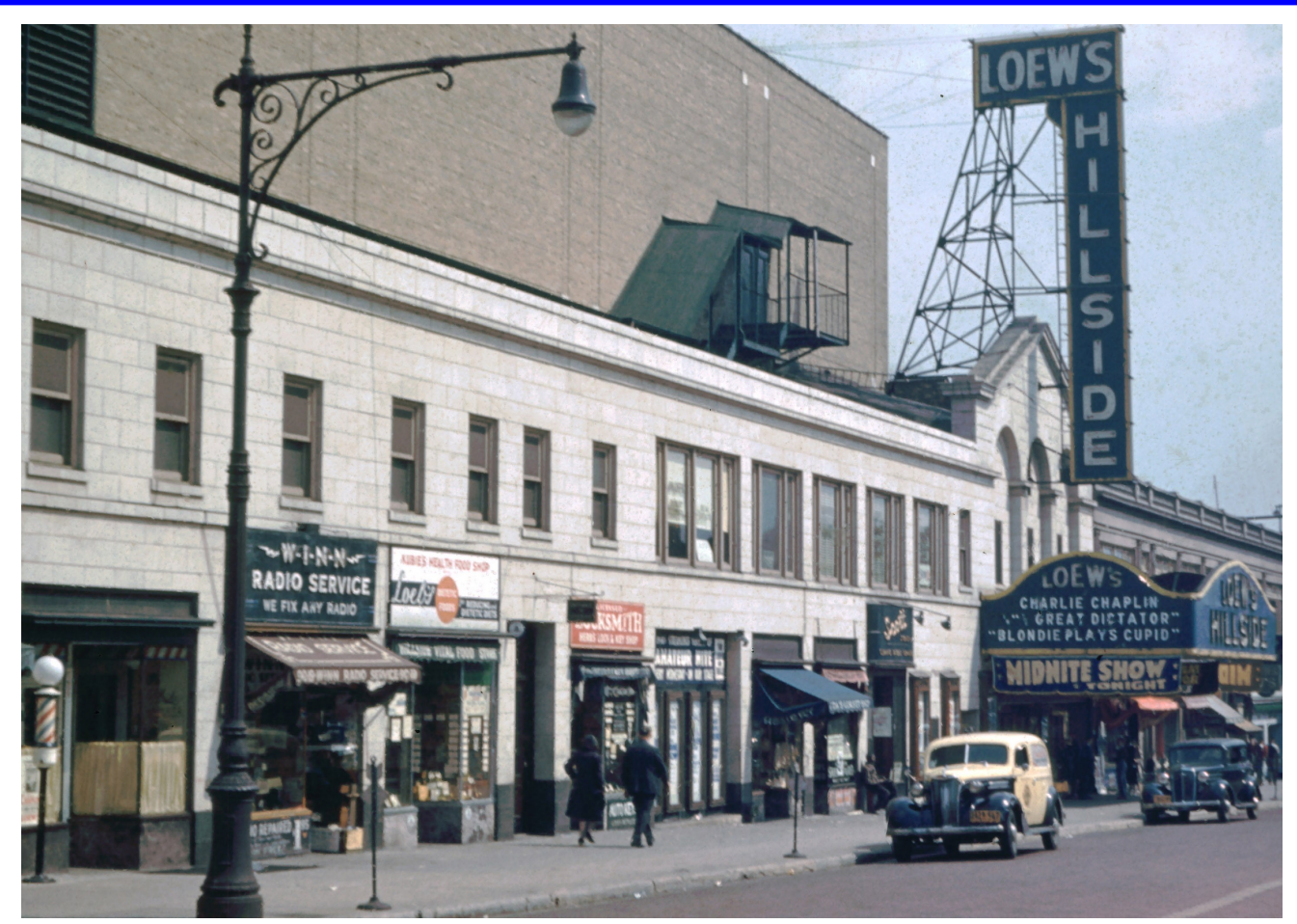
Hillside Ave., Jamaica New York 1940

Also remember all the good times you had over the years being a member of Regional Group #124. Hopefully there are many good times ahead. You can make that possible by volunteering to host an upcoming meeting, contributing an article to the Newsletter or just showing up at a future meeting.