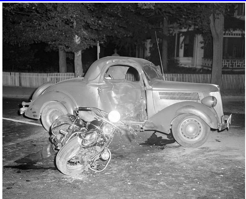
Ford versus Motor Cycle!!