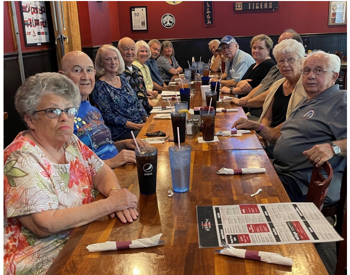
Oct 2008 Wildwood Pub