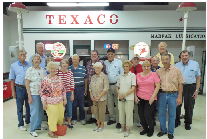
May 2006 Tour