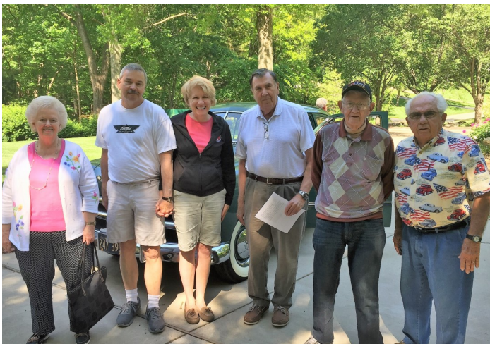
May 2008 Webster Groves Tour