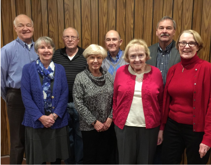
Jan 2001 Instalation