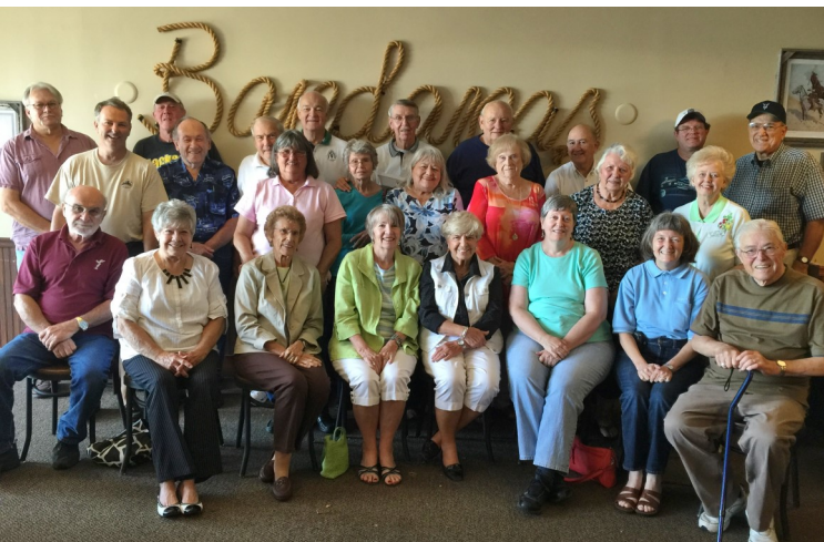
2008 Meeting Bandanas