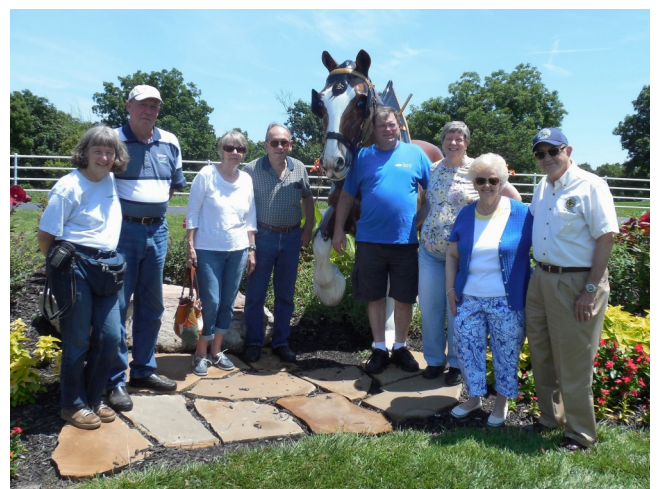
Oct 2008 Wildwood Pub