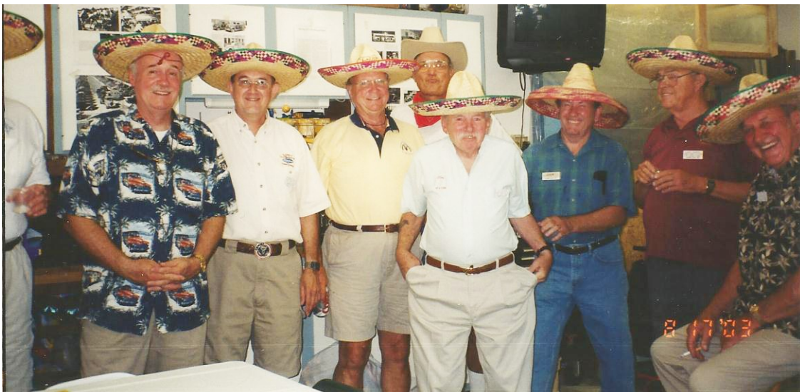
Those Were The Days My Friends!!!!

Want to enjoy a great breakfast with good friends? Please consider joining us on Saturday, April 2nd at the Village Café. Details are in Future events at the end of the Newsletter