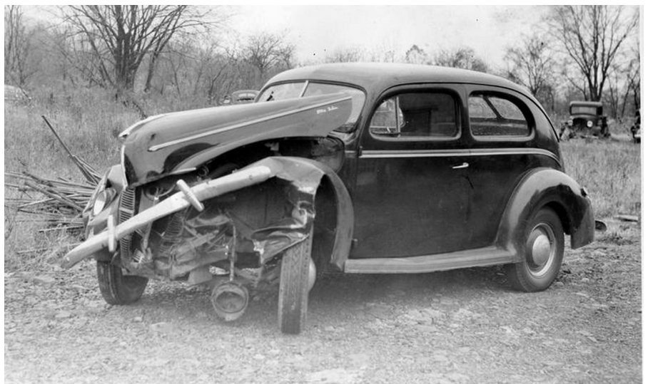
Solid 40 Sedan....Pulls to The Left a Bit!!