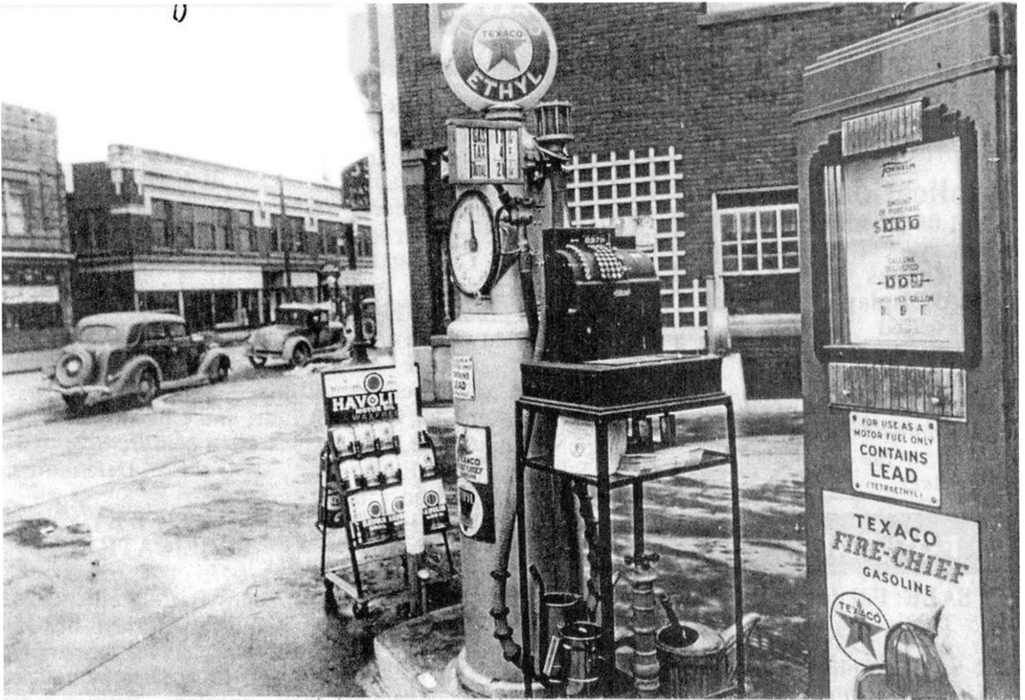
Rooney Plaza, 1937, was Stilwell & Wright Texaco - Fire Chief, 19c/gal.; Ethyl, 21c.

This picture is from my home town of Lawrenceville, Illinois. across the street from the old Ford cars is the Ford Garage. As a teenager the guys with motorcycles hung out at S&W I got arrested when I was 14 years old. On a dare, I rode my motorcycle on the sidewalk from the gas station to the end of the block. Seems like I pissed off a few merchants. My dad had to come to the police station and get me. My fine was $2.00!! Nothing was said about not having a driver's license.