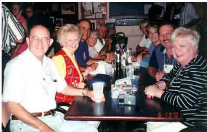
V-Eaters like this happy group