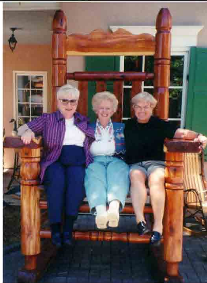
“Rub-a-dub-dub, Three gals in a tub” ---oops! wrong photo!