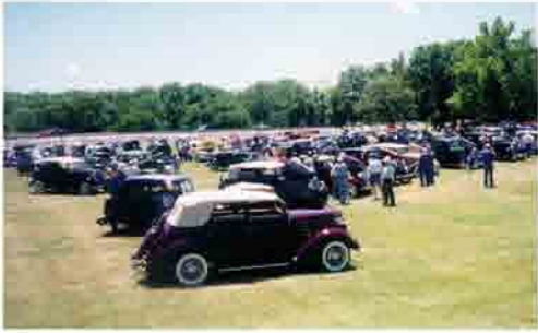
What we all came for!