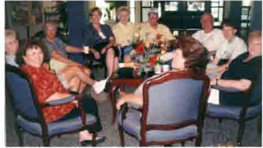
And this too!!