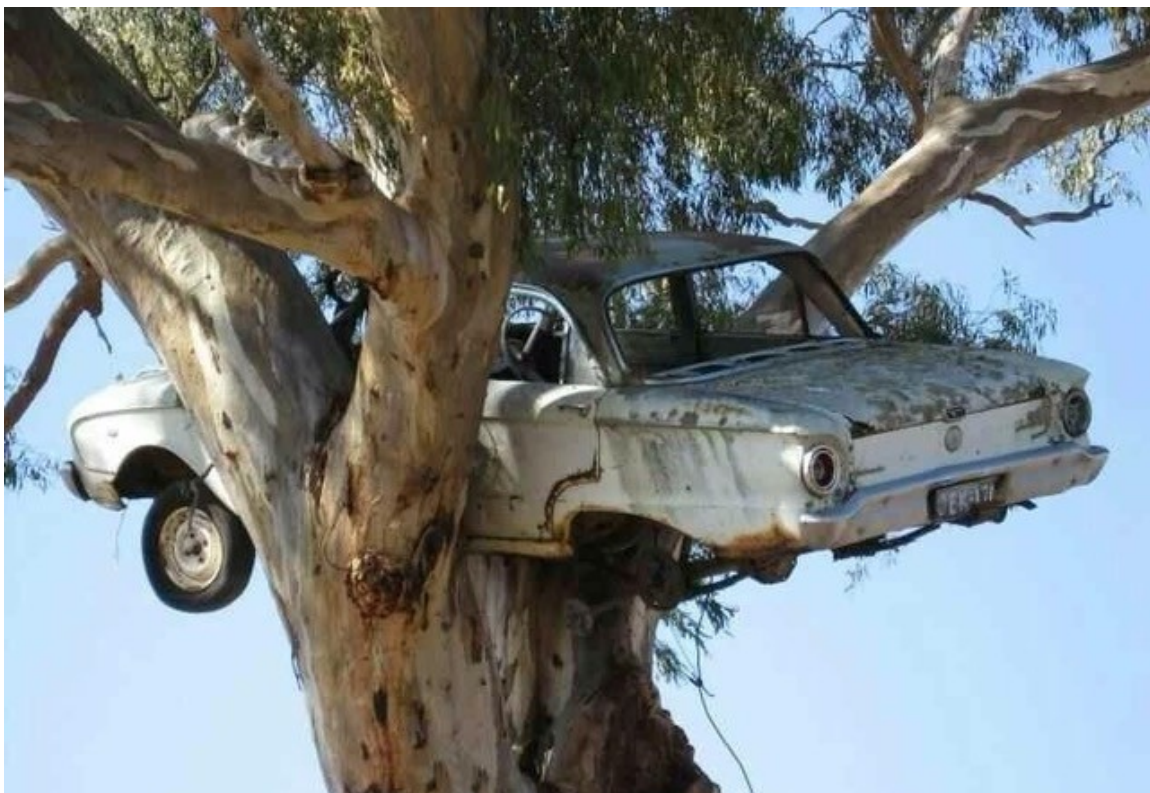
A Rare Sight For Bird Watchers....A Falcon Nesting In A Tree

The Registration forms have started to be mailed out for The Eastern National Meet in Franklyn, TN. this June. Please see the flyer in this month's Newsletter. It promises to be a great event!