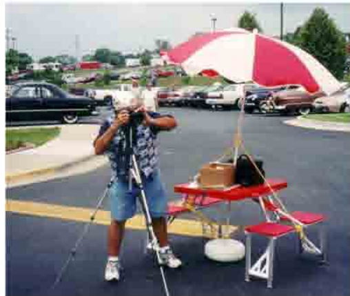
That's Don Taylor behind the camera. He probably worked the hardest (150-200 cars) but perhaps enjoyed it the most --- seeing ALL the cars.... "up close and personal"