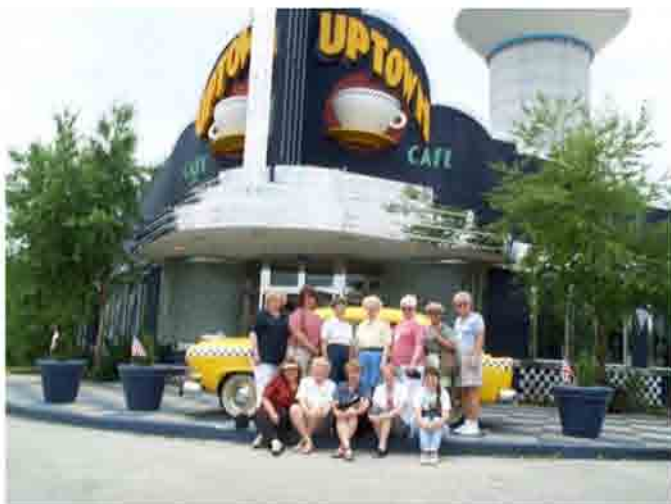
Upscale dining at the Uptown Cafe for the ladies!