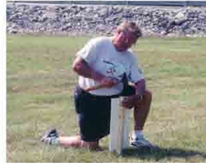
The highly esteemed President of RG #124