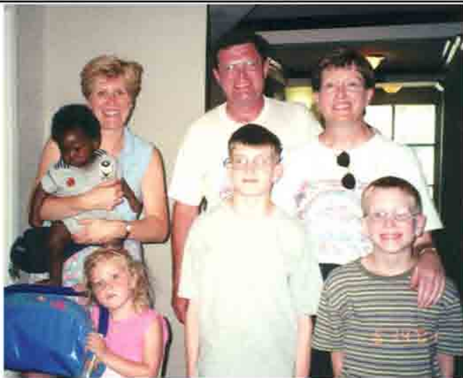
And families too...future V-8ers & V-Eaters