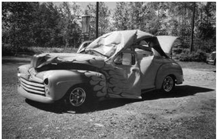
Perhaps He Should Read The Clearance Sign Again!!!!